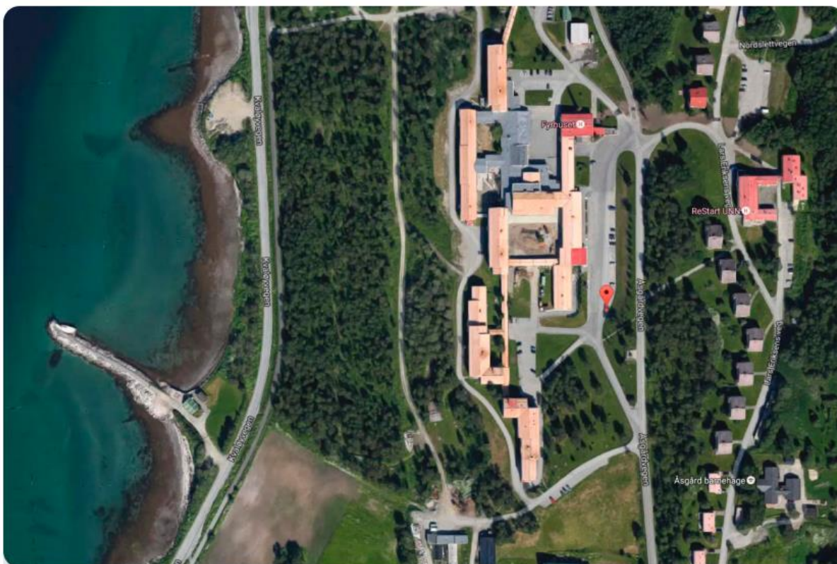
Kart over området til UNN Åsgård