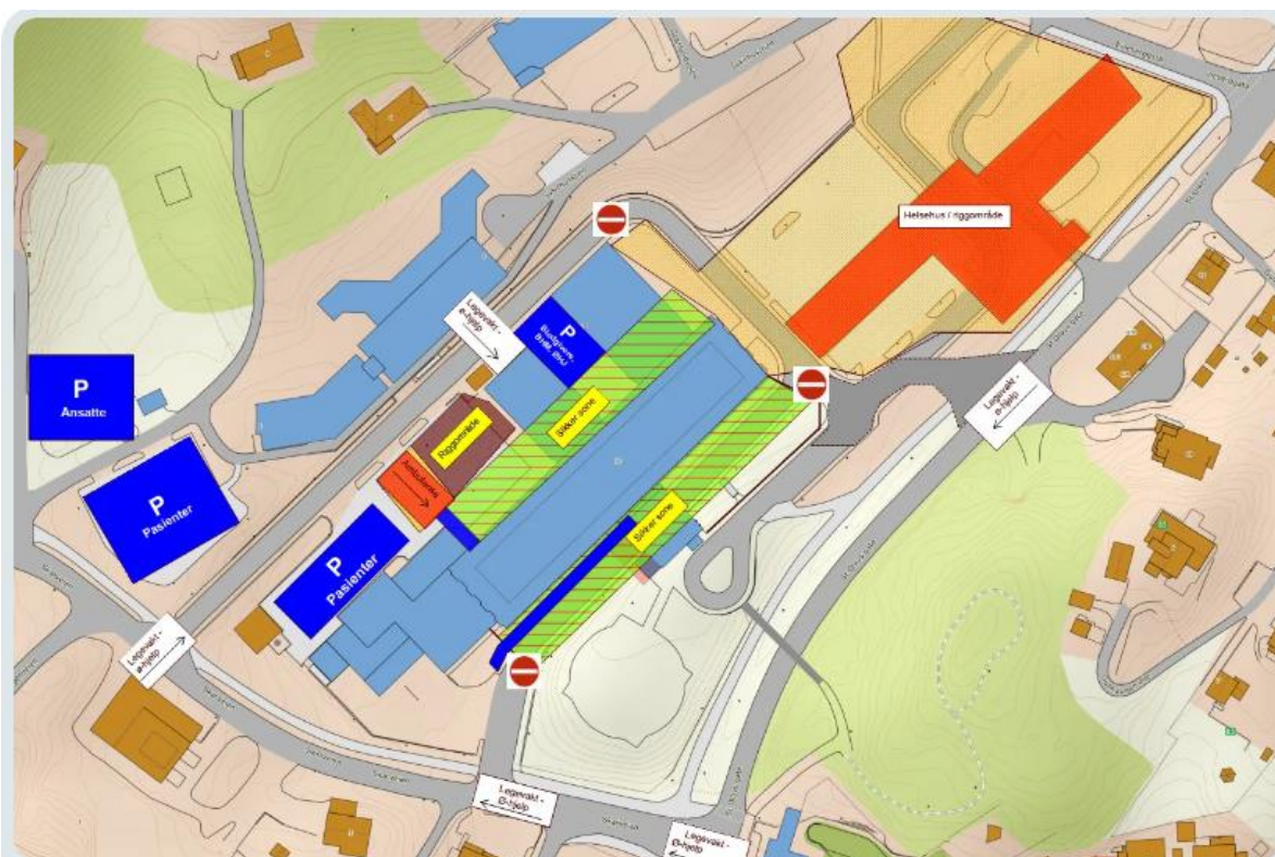
Oversikt over Harstad